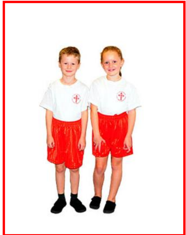
School PE kit