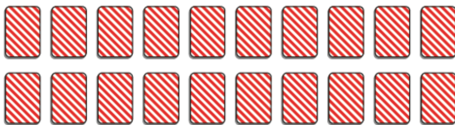
2 rows of 10

Holly wants to arrange 20 cards for a memory game. Each row should have the same number of cards. This is one way she can arrange the cards.