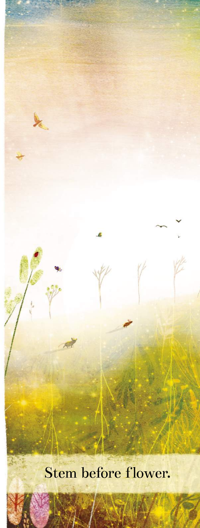
Stem before flower.