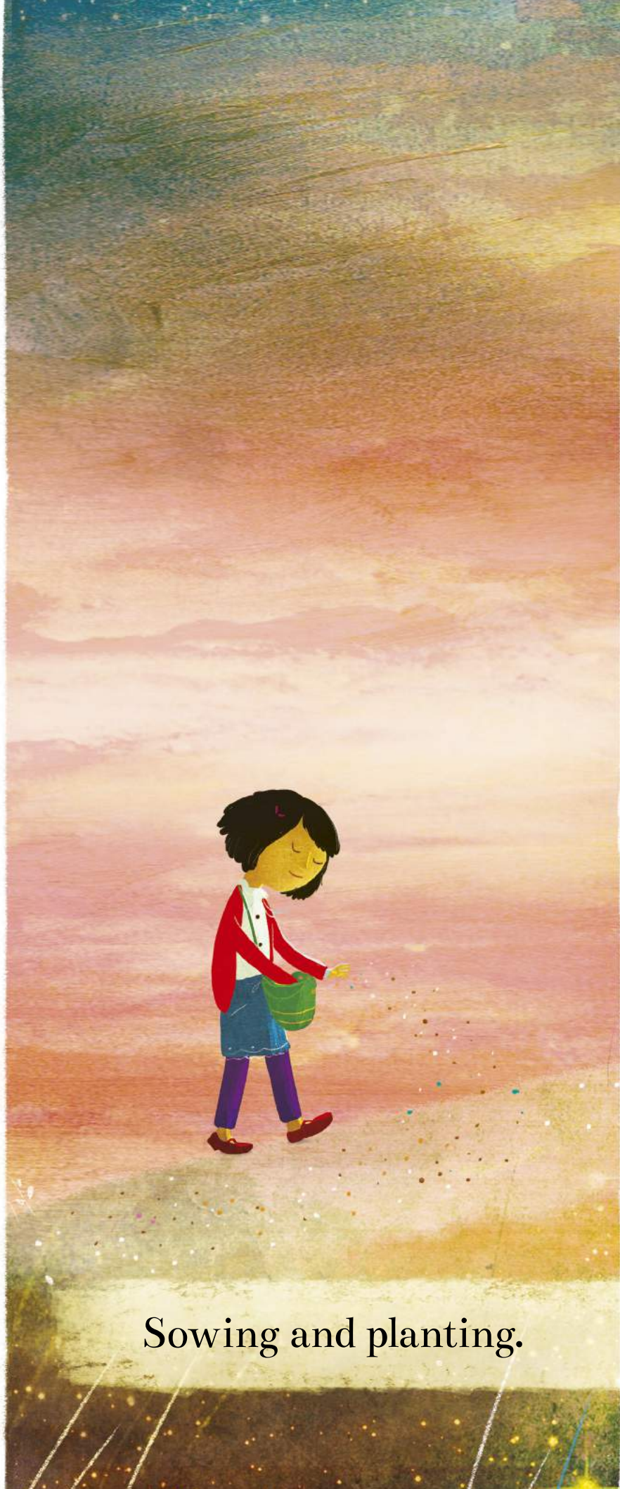
Sowing and planting.