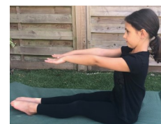
3. pike straddle