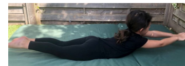
8. front straddle