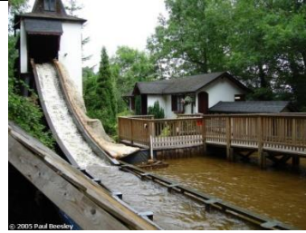
The Log Flume