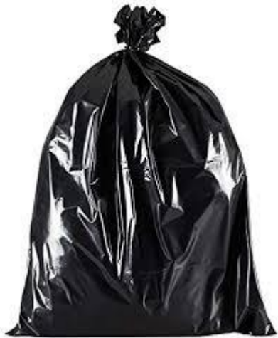
Bin bag for dirty clothes