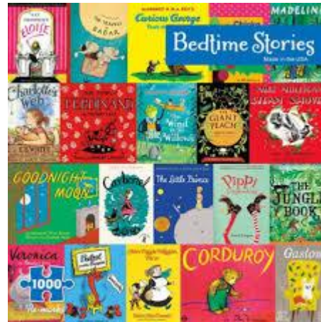
Story Books Puzzle Books