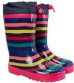
Wellies in a labelled carrier bag