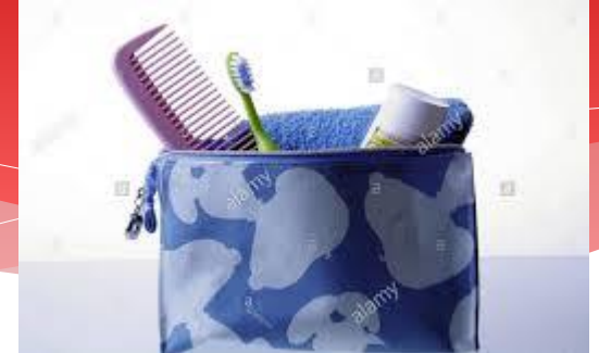
Wash bag with flannel, soap, toothpaste and toothbrush