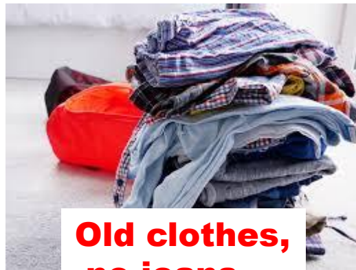
Old clothes, no jeans