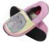
Clothes for next day spare clothes and underwear