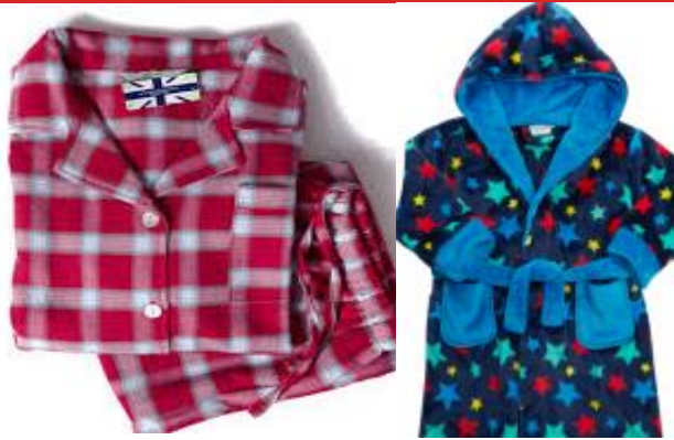
Night wear, dressing gown and slippers