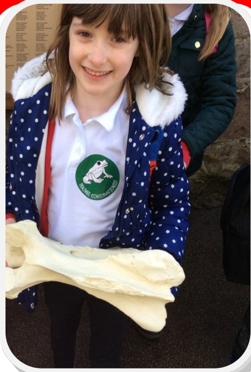
WOW - Look how big one neck bone is!

Following on from the School Funding Cuts petition, Warrington school children are setting their own challenge to the Government over fairer funding with a unique take on 'Food, Glorious Food'. View the video on the 'Latest News' section of our website.